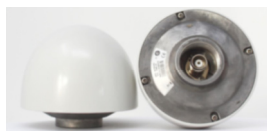
High Gain GPS antenna

The High Gain GPS Antenna is designed for stationary application, all weather and harsh environment to provide a strong signal. This antenna is also a high-quality solution for adding GPS RF signals to marine GPS navigation systems. The high gain GPS antenna can be setup with up to 70 meters of cable. The high gain GPS antenna is supplied with stainless steel antenna mount.