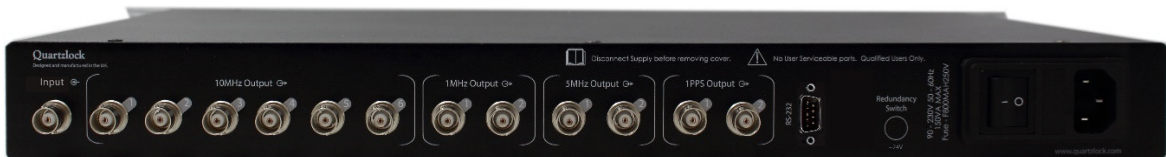
Example of rear panel configuration with 10MHz input and 1MHz, 5MHz & 1PPS output

The Quartzlock logo is a registered trademark. Quartzlock continuous improvement policy: spec subject to change without notice and not part of any contract. Copyright © 2017. Issue 017.01